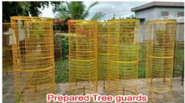
Prepared Tree guards