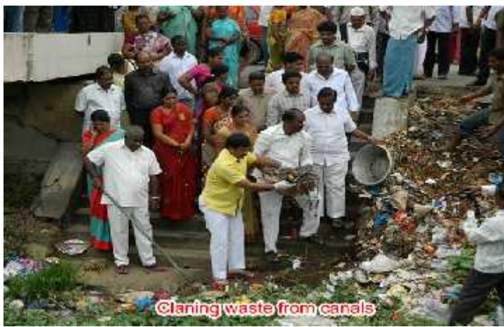
Claning waste from canals