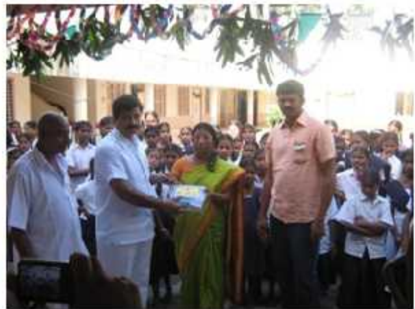
Donating Cricket Kits and Medical Kits