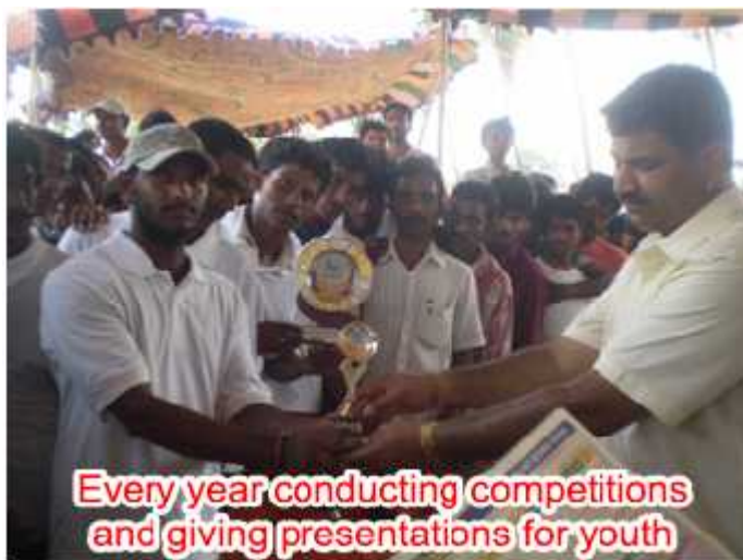
Every year conducting competitions and giving presentations for youth