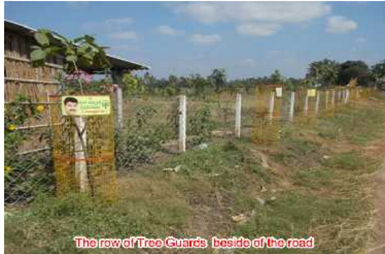
The row of Tree Guards beside of the road