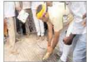
శ్రీ గార్డు తయారీకి శ్రీకారం వేణుబాబు

ఉండి నియోజకవర్గానికి 30 వేల ట్రీ గార్డులు తయారీ చేస్తున్నట్లు ఎంపీ ఎమ్మెల్యే శ్రీకారం వేణుబాబు తెలిపారు. వీటిని ఉండి నియోజకవర్గానికి ప్రభుత్వ ట్రీ ప్లాంట్ల కమిటీ ద్వారా అందజేస్తామని తెలిపారు. వీటిని ఉండి నియోజకవర్గానికి ప్రభుత్వ ట్రీ ప్లాంట్ల కమిటీ ద్వారా అందజేస్తామని తెలిపారు. వీటిని ఉండి నియోజకవర్గానికి ప్రభుత్వ ట్రీ ప్లాంట్ల కమిటీ ద్వారా అందజేస్తామని తెలిపారు.