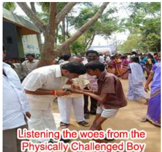
Listening the woes from the Physically Challenged Boy