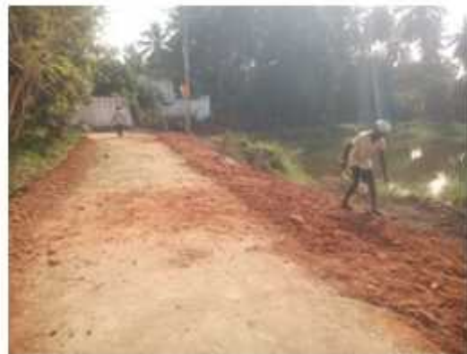
Laying New Roads Setting the Berms in all the villages at Kallakuru