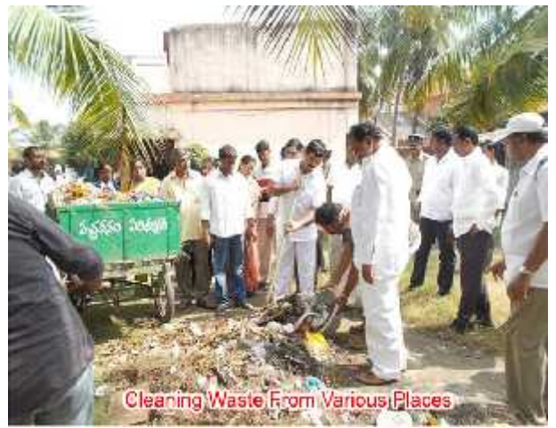
Cleaning Waste From Various Places