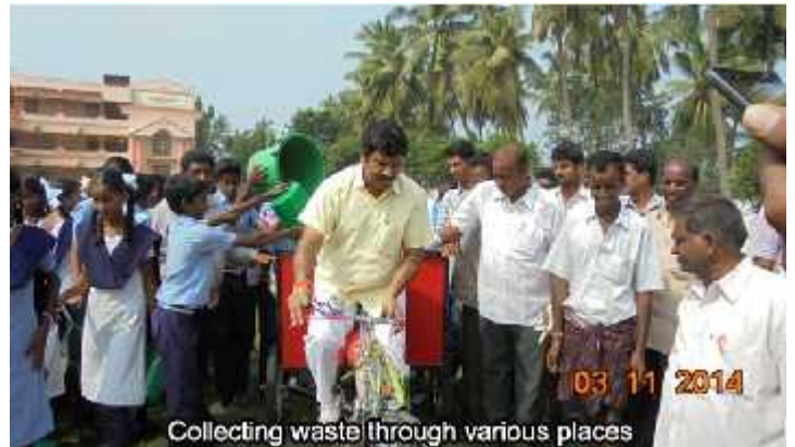
Collecting waste through various places