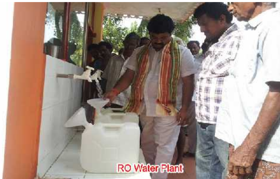
RO Water Plant

Siva has taken measures to ensure healthiness among people and has started setting up several medical sub-centers across the villages which are assigned the task of diagnosing and providing first-aid to people and preventing negligence of health among the citizens of the constituency. To support this, measures for safe drinking water were provided, and to combat the diseases spread due to the drainage-filled wetlands, efficient underground drainage systems were setup through the 70 villages.