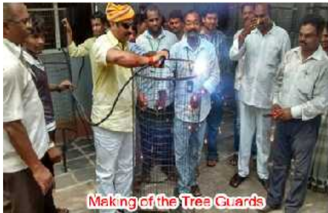
Making of the Tree Guards