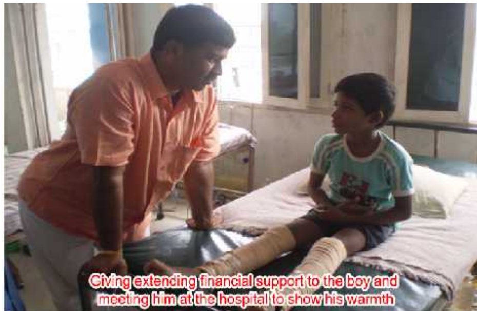
Giving extending financial support to the boy and meeting him at the hospital to show his warmth