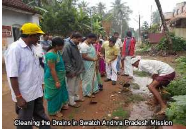
Cleaning the Drains in Swachh Andhra Pradesh Mission