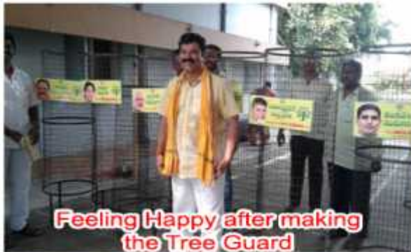
Feeling Happy after making the Tree Guard

Horticulture, floriculture and olericulture (vegetables) have been massively promoted by the provision of 70,000 packets of vegetable seeds and 3,00,000 horticulture plants of various kinds across all 70 villages in the constituency to increase self-sufficiency, promote cleanliness and eco-friendliness. This seed provision would be continued into the future every year, and further expanded as this culture grows.